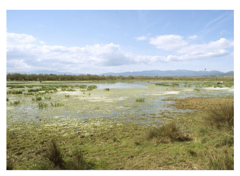
Fig. 1. Estany de Vilaüt, a freshwater pond located in the Natural Park of Aiguamolls de l'Empordà. (NE of the Iberian Peninsula). Author: Dani Boix

The Conference will take place at the Huesca Congress Palace (Palacio de Congresos de Huesca) in the city of Huesca, Huesca Province, one of the three provinces of the Aragón Autonomous Community, in northern Spain.. The Conference Venue is close to a number of hotels