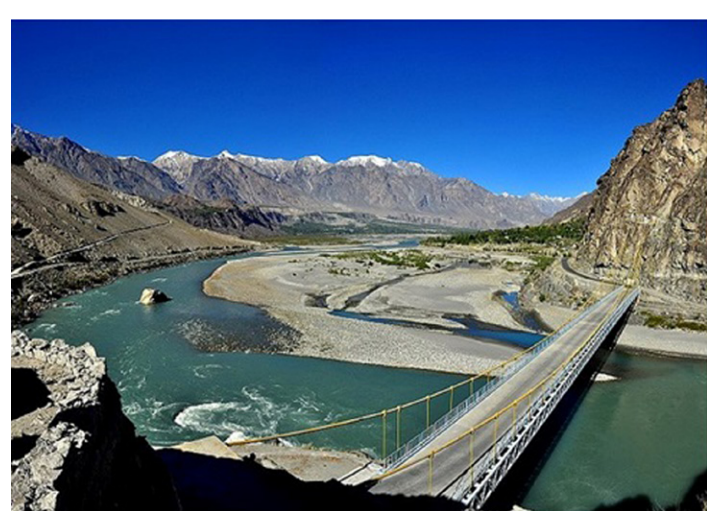
River Indus in Northern Pakistan with spectacular view of Kara Kuram Highway (ancient silk route)