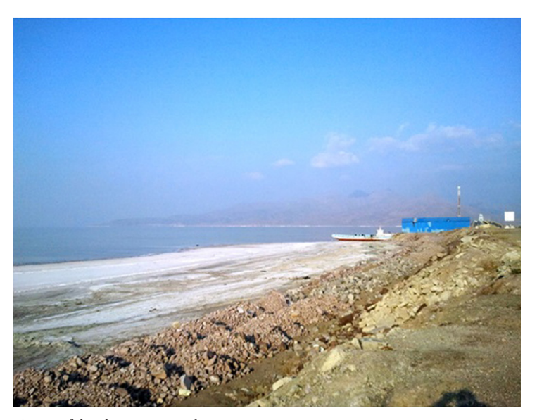
A coast of shrinking Urmia Lake.

Irrigation Revolution (best practice of irrigation) and Green Revolution (using newly-selected domestic plants requiring less irrigation water); 5) Information. Scientific and public perceptions regarding lake basin management can differ from case to case. Without knowledge generation and sharing, human and financial resources mobilized in the lake basin management efforts may not be effective; and 6) Finances. Financial resources should come from all basin stakeholders that directly or indirectly benefit from the use of lake resources. Efforts must be made to develop innovative approaches for generating locally usable funds.