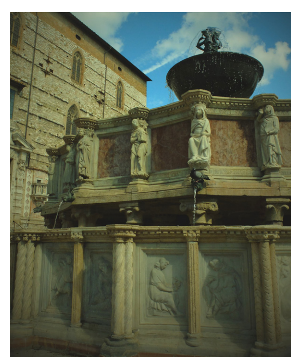
The "Maggiore Fountain": an iconic symbol of Perugia.