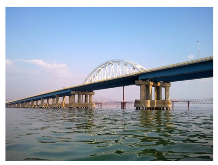
Bridges over Urmia Lake.