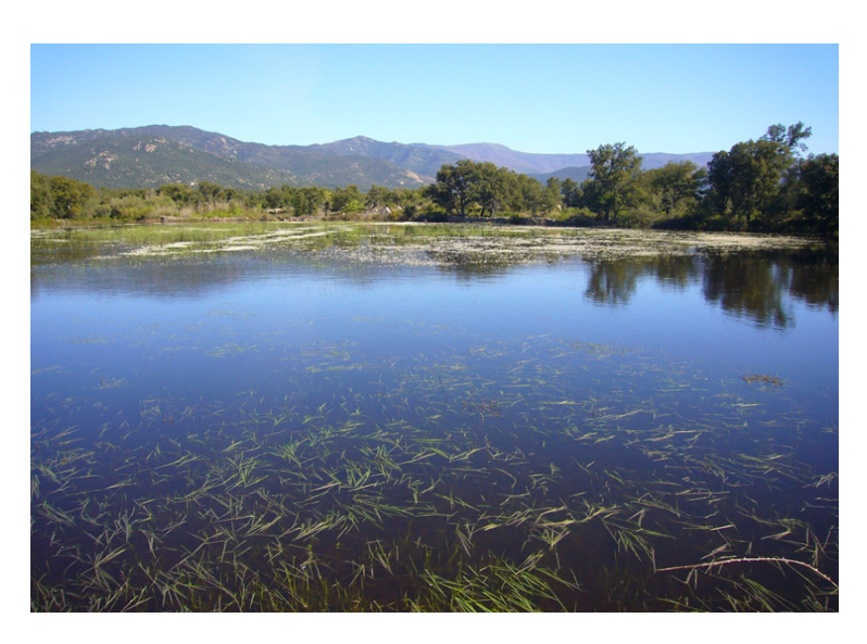
Fig. 2. Estany de Canadal de Baix, a temporary pond located in the plain of the Albera Massif (NE of the Iberian Peninsula). Author: Jordi Sala

i.e. at a 10-25 min walking distance from the hotels in Huesca. In the web page (wetlands2014@csic.es) you will find different possibilities to participate in this Conference. Please visit the Programme, Calls and the Registration Section and make your choice for participating. If you wish to contribute as Partner or Sponsor, please visit the Exhibitor/Sponsor Section or contact with the Conference Secretariat.