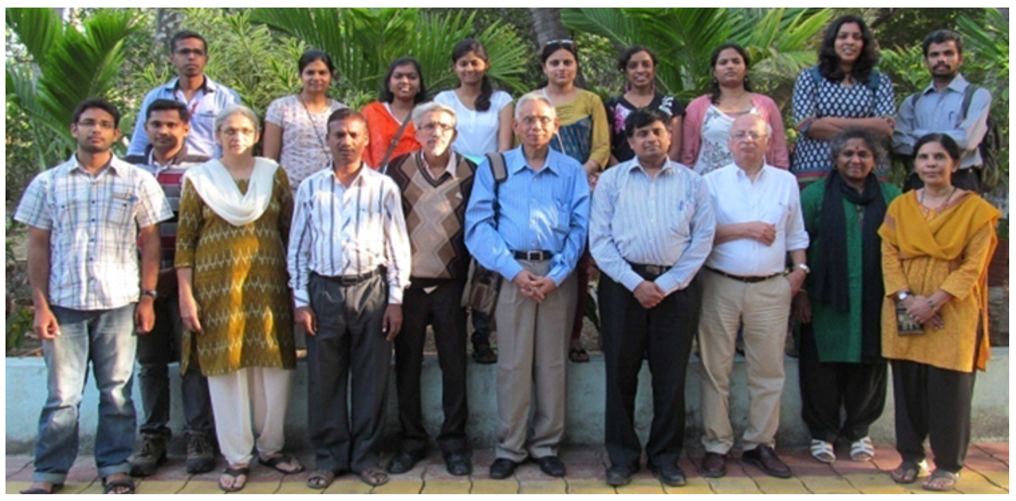
Fig. 2: Group photograph of participants attending the workshop on taxonomy & ecology of zooplankton in the University of Pune (UoP)

versities and the affiliated colleges participated in the workshop.