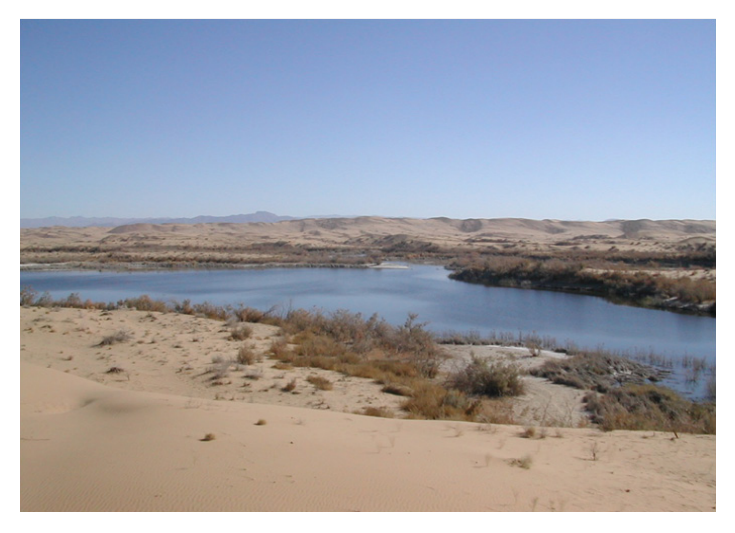
A stunning view of unique desert wetlands Zangi Nawar Lake in southern Balochistan. Pakistan