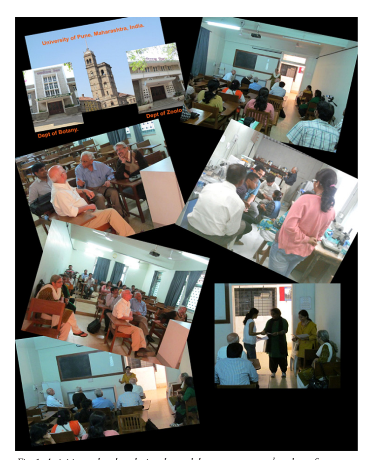
Fig. 1: Activities undertaken during the workshop on taxonomy & ecology of zooplankton in the University of Pune (UoP)

Western Ghats is one of the biodiversity hotspot, which is rich in diversity and harbours many endemic species of fauna and flora. Western Ghats constitute a mountain range along the western side of India. It is a UNESCO World Heritage site and is among the eight "hottest hotspots" of biological diversity in the world. The mountain range runs north-south