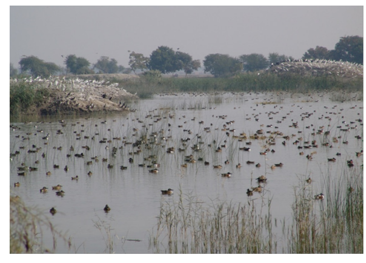
Wintering water birds at Lungh Lake in southern Sindh, Pakistan.

In Sindh province, Manchar Lake is the largest freshwater lake in Pakistan and one of the largest in Asia, located west of the Indus River. It fluctuates in area seasonally from about 350 km² to 520 km² and it