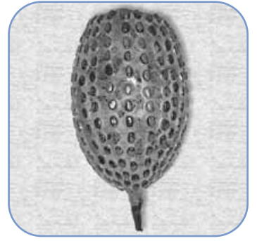
Phacus sp. - wall vase