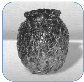
Difflugia bravicolla - table vase

Hakumat Rai Heikendorf, Germany HRai@gmx.de