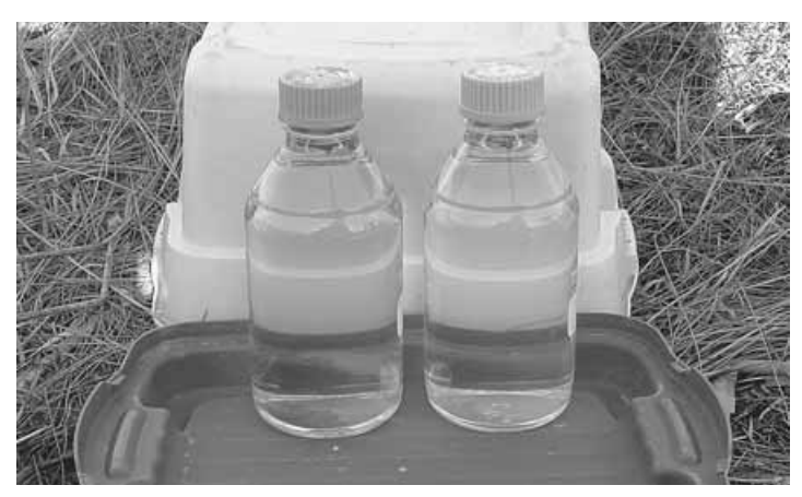
Photograph of coloured Oscar Creek water (left) and clear, non-coloured Redberry Lake water.

UV-R to a far less extent than DOC in either Oscar Creek or other prairie systems having similar DOC concentration (Fig. 1; Waiser and Robarts 2000). Combining Redberry data with that from other saline systems, it was found that slopes of UV-A and UV-B versus DOC were significantly less than freshwater relationships (Arts et al. 2000). The fact that UV light penetrated much deeper into saline systems than freshwater counterparts was related to DOC composition. A Redberry Lake study which compared source DOC (from Oscar Creek) to lake DOC revealed that lake DOC had higher C:N ratios, was lower in molecular weight, chromphoric constitutuents and aromaticity and was older than source DOC (Fig. 2). DOC entering the lake was essentially 'trapped' in the endorheic basin. Over many years, coloured DOC, originating from Oscar Creek lost more than half of its aromaticity due to photodegradation. Low aromaticity and chromophoric constituents accounted for the high penetration of UV light in Redberry Lake (Waiser and Robarts 2000).