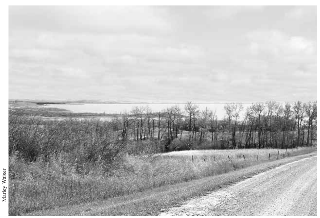
Approaching Redberry Lake, Saskatchewan, Canada

The International Association of Theoretical and Applied Limnology works worldwide, to understand lakes, rivers and wetlands and to use knowledge, gained from research, to manage and protect these diverse, inland aquatic ecosystems.