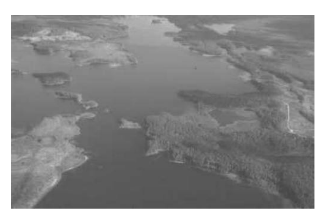
An air-photo of the Puhoslahti Bay area of Lake Saimaa.

Contributions on a PC formatted disk, in any standard word processor or DOS (ASCII) text, or as email attachments, will assist the Editor.