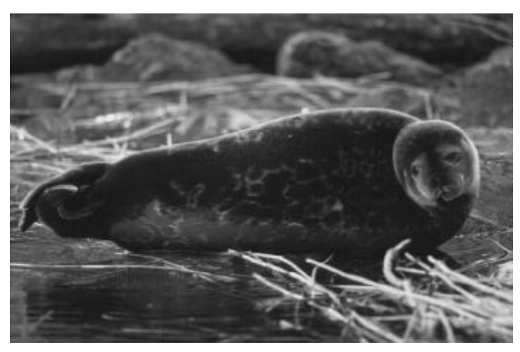
Figure 2 - The most endangered species in Lake Saimaa is the Saimaa ringed seal (Phoca hispida saimensis Nordq.). This three month old pup seal (typically there were approximately 250 seals) is resting on a rock during the day. Photo was taken by Mervi Kunnasranta at Lake Haukivesi.

The landforms of the Finnish lakeland are dictated by the fractured crystalline bedrock of the Fennoscandian Shield and the effects of the last glaciation, resulting in a generally level but a microtopographically very variable landscape. Since the melting of the continental ice mass, the rebound action of the earth's crust has resulted in isostatic land uplift around the northern Baltic Sea. Most of the lake basins of southern Finland were part of the Baltic in the early post-glacial period, and became isolated from it in a stepwise manner during the Yoldia Sea and Ancylus Lake stages of the Baltic (11,600-10,700 and 10,700-9,500 years ago, respectively).