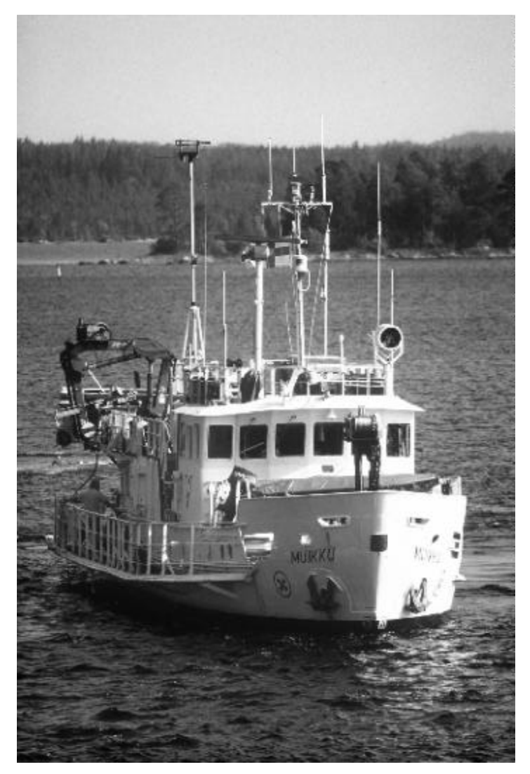
Figure 3 - The research vessel Muikku at work in the labyrinthine landscape of Lake Saimaa. Photo was taken by Markku Viljanen in the Kolovesi area.

Aquatic research in Lake Saimaa is carried out by several universities, research institutes and environmental authorities, which are also represented in a coordinating organisation (Coordination Committee for Research on Large Finnish Lakes), which aims to enhance large lake research through the preparation of research programmes, i.e., for Lake Saimaa. Many of the research projects are conducted jointly, for example, a joint EU LIFE Vuoksi project (2001–2004), "The role of the littoral area as a part of an optimal model for environmental monitoring and the involvement of local people" (Airaksinen et al. 2001).