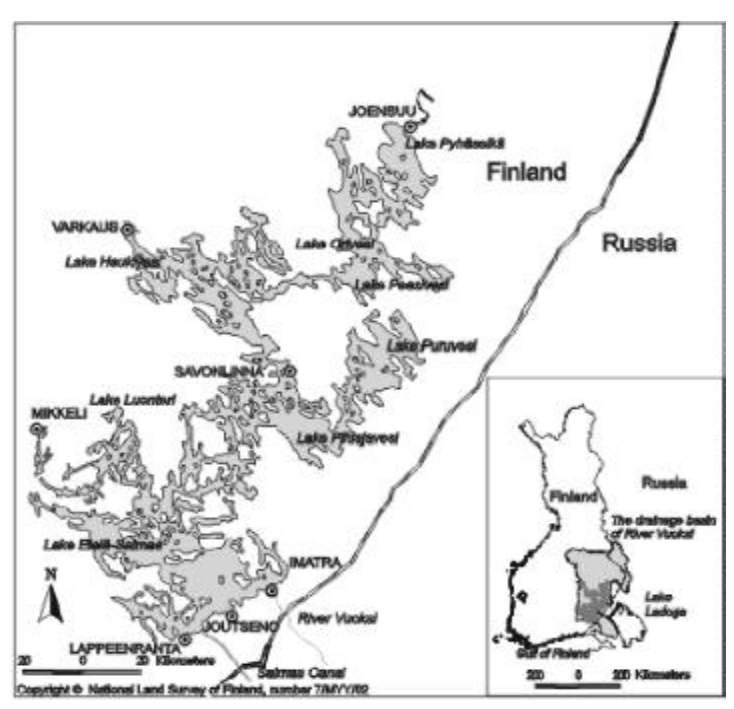
Figure 1 - Location of the drainage basin of the River Vuoksi in Finland and Russia (right) and the drainage basin of the Lake Saimaa complex (left).

Finland is well and truly a lakeland: it has 187,888 lakes (10% of its territory) with areas >500 m<sup>2</sup> which includes 47 lakes that are larger than 100 km<sup>2</sup>. The Lake Saimaa complex, with a surface area of 4,400 km<sup>2</sup>, is the largest of all and ranks as the fourth largest lake in Europe. Lake Saimaa is the central lake of the 68,500 km<sup>2</sup> Vuoksi drainage area, and drains via the River Vuoksi into Lake Ladoga in Russia and eventually into the Gulf of Finland. Its water level is about 76 m above sea level. The lake is extremely complex in terms of its geomorphology, consisting of several large sub-basins of varying limnological character connected by relatively narrow straits (Figure 1). Its labyrinthine character is also revealed statistically by its long shore line (14,850 km) and large number of islands (around 14,000) (Kuusisto 1999). The maximum depth is 85 m and there are several sub-basins with depths exceeding 50-60 m, but the median depth is only 8 m.