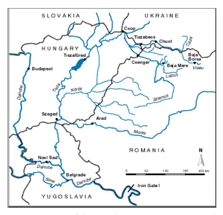
Figure 1 – Map of the Danube-Tisza-River-System, with the locations of Baia Mare and Baia Borsa gold mine accidents.

Apart from the nasty oil spills by broken tankers in oceans (e.g., "Exxon Valdes" in Alaska 1996, "Erika" along the Bretagne in France 1999) or by pipelines leaking into large rivers (e.g., Iguaçu in Brasil, July 2000) we can find, in steady though irregular intervals, ill news about accidental spills from mines in aquatic environments around the world. So, this type of severe pollution is a global problem, too! Would you like confirmation? Well, here are some prominent and recent examples, and this list is not complete by far: