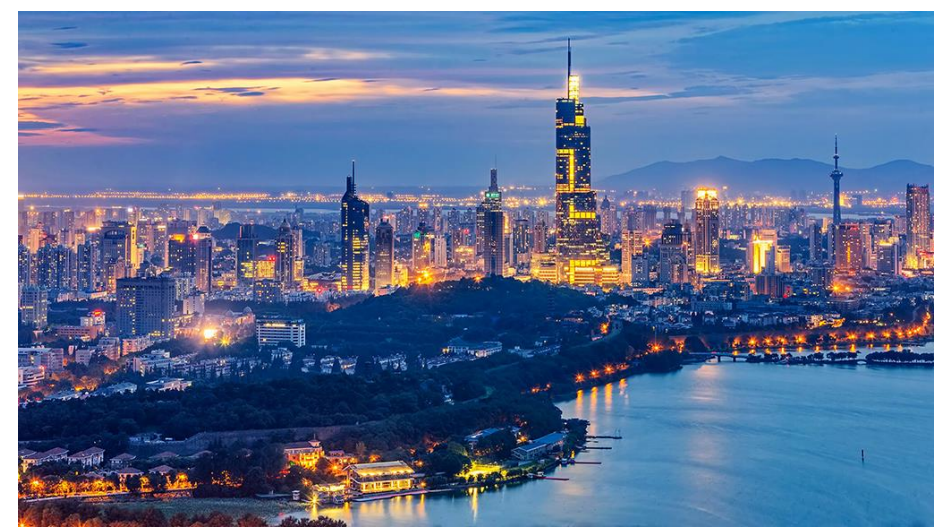
Host city: Nanjing, the capital of Jiangsu Province, China.

Secretariat of SIL 2018 Nanjing Institute of Geography and Limnology, Chinese Academy of Sciences East Beijing Road 73, Nanjing 210008, Jiangsu Province, CHINA E-mail: sil2018@niglas.ac.cn Tel: 0086-(0)25-86882103; 86882213 Fax: 0086-(0)25-57714759 Website: http://www.sil2018.com/