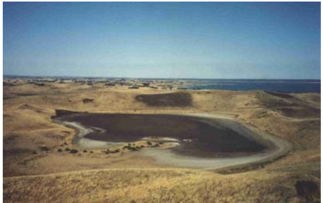
Lake Werowrap, in Victoria State, Australia in a dried-up state. The lake, located in an explosion crater or maar, is highly alkaline and moderately saline when full. Photo was taken during the mid-congress Salt Lakes and Otway Ranges tour.

Material for the next issue should be sent to the Editor for June 22 :