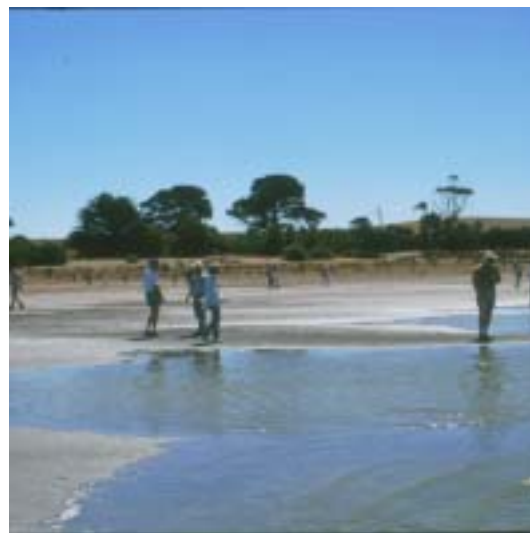
SIL Congress participants view Lake Corangamite during the Salt Lakes and Otway Ranges tour.