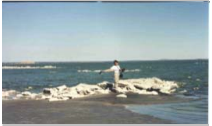
Marlene Evans of Environment Canada admiring Lake Corangamite while on the Salt Lakes and Otway Ranges tour.

A highlight of the meeting, I think many will agree, was the lively barbecue that was accompanied by abundant and very good Australian wines and an exceptional local band. The mid-congress excursions, that allowed participants to see a bit more of Australia, were rated as excellent by all participants, in fact so much so, that many of us wished it had been possible to participate in more than one!