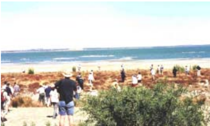
SIL Congress participants view Lake Corangamite, during the Salt Lakes and Otway Ranges tour. Lake Corangamite is the largest lake in Victoria and the largest permanent body of inland saline water in Australia. It is a volcano-tectonic basin, collapse having occurred over a very large area.