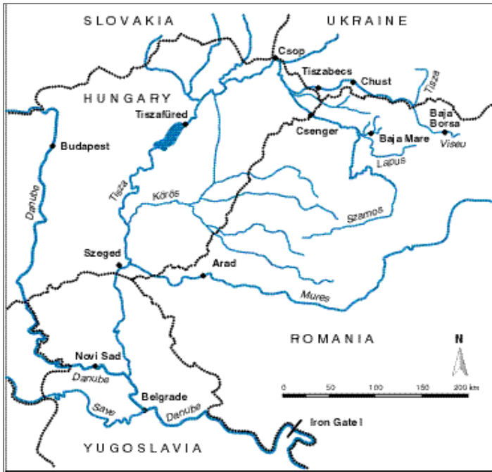
Figure 1 – Map of the Danube-Tisza-River-System, with the locations of Baia Mare and Baia Borsa gold mine accidents.

Apart from the nasty oil spills by broken tankers in oceans (e.g., “Exxon Valdes” in Alaska 1996, “Erika” along the Bretagne in France 1999) or by pipelines leaking into large rivers (e.g., Iguacu in Brasil, July 2000) we can find, in steady though irregular intervals, ill news about accidental spills from mines in aquatic environments around the world. So, this type of severe pollution is a global problem, too! Would you like confirmation? Well, here are some prominent and recent examples, and this list is not complete by far: