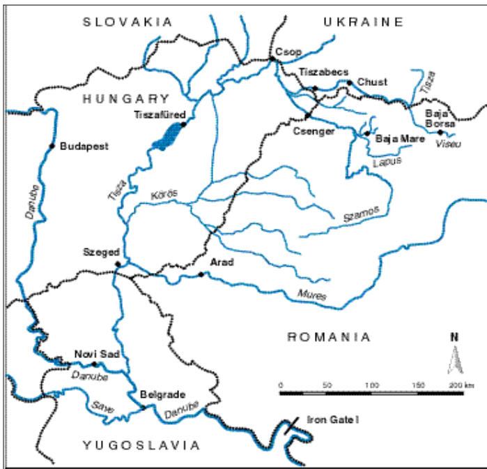
Figure 1 – Map of the Danube-Tisza-River-System, with the locations of Baia Mare and Baia Borsa gold mine accidents.

Apart from the nasty oil spills by broken tankers in oceans (e.g., “Exxon Valdes” in Alaska 1996, “Erika” along the Bretagne in France 1999) or by pipelines leaking into large rivers (e.g., Iguacu in Brasil, July 2000) we can find, in steady though irregular intervals, ill news about accidental spills from mines in aquatic environments around the world. So, this type of severe pollution is a global problem, too! Would you like confirmation? Well, here are some prominent and recent examples, and this list is not complete by far: