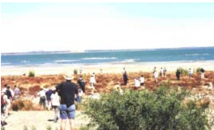
SIL Congress participants view Lake Corangamite, during the Salt Lakes and Otway Ranges tour. Lake Corangamite is the largest lake in Victoria and the largest permanent body of inland saline water in Australia. It is a volcano-tectonic basin, collapse having occurred over a very large area.