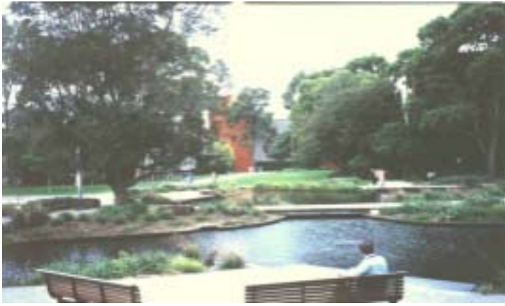
A serene view of the Clayton central campus area at Monash University during the SIL Congress.