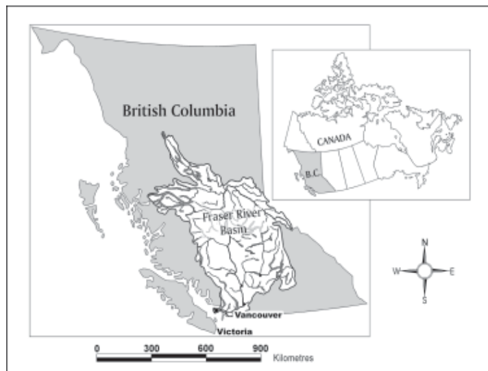
Figure 1 - The location of the Fraser River Basin in the province of British Columbia in Canada.

The Fraser River is a major ecological asset in Canada which provides many economic and social benefits to the two and half million people who live in its basin. It still exhibits much of its original biological diversity because its main channel has not been controlled to any significant degree by dams and industrial, agricultural and urban development has not been extensive in its tributary basins. Even though the “foot print” of humanity is not large here, significant water quality degradation has been documented.