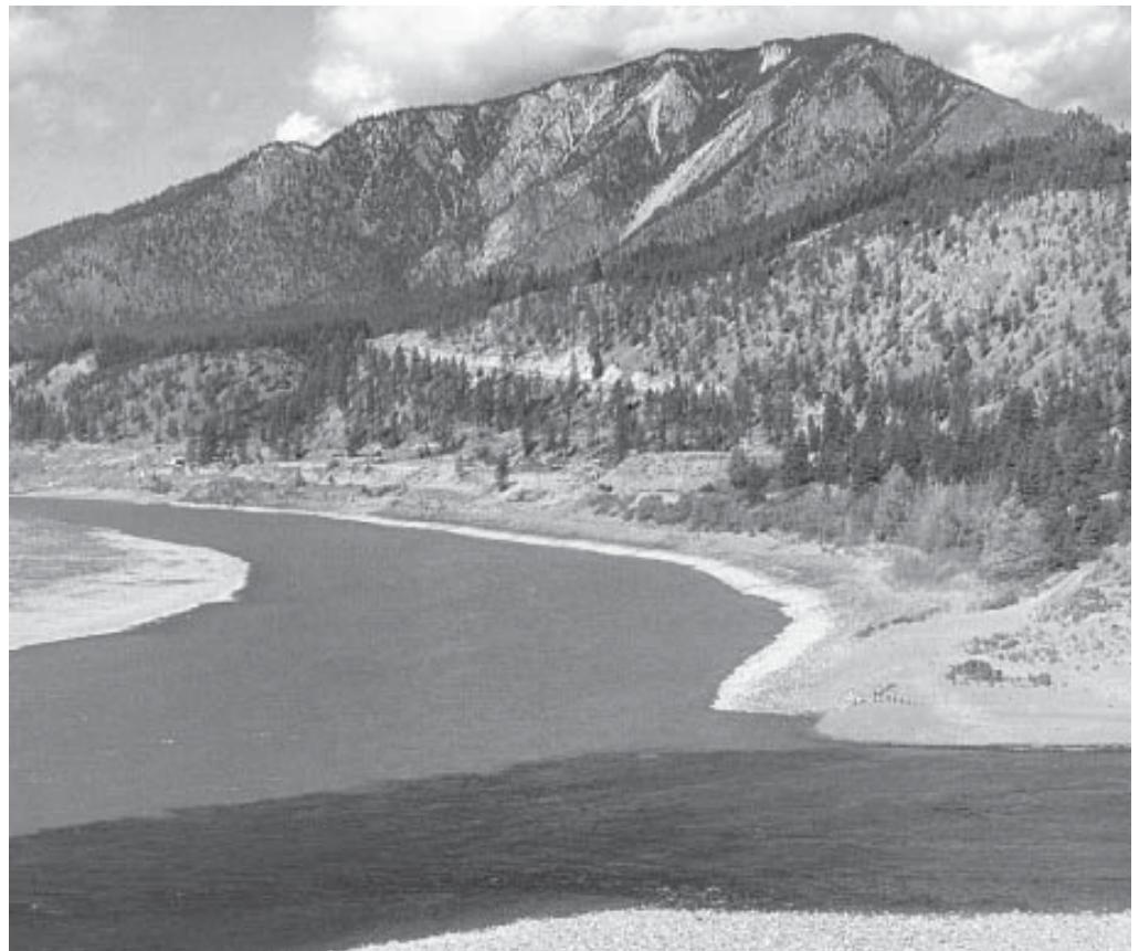
The confluence of the Fraser River and its major tributary, the Thompson River located about 200 km upstream from the ocean. (Photo taken by Mark Sekela, summer of 1991)

Material for the January 2002 issue should be sent to the Editor for October 1, 2001: